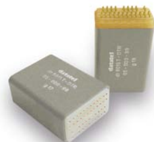
Digital Telemetry Transmitter Modules